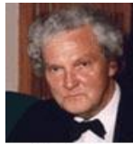
The Rt Hon Lord Slynn of Hadley